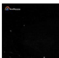
Without white light