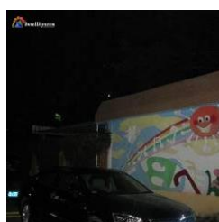
With white light